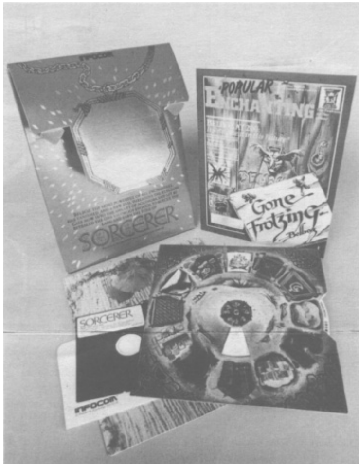
Included in the Sorcerer package you will find an issue of Popular Enchanting Magazine, the Creatures of Frobozz Infotater, and a handy storage pouch.