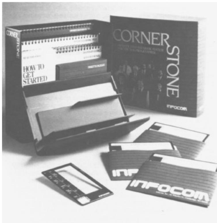
Cornerstone: The sophisticated database system for the non-programmer.